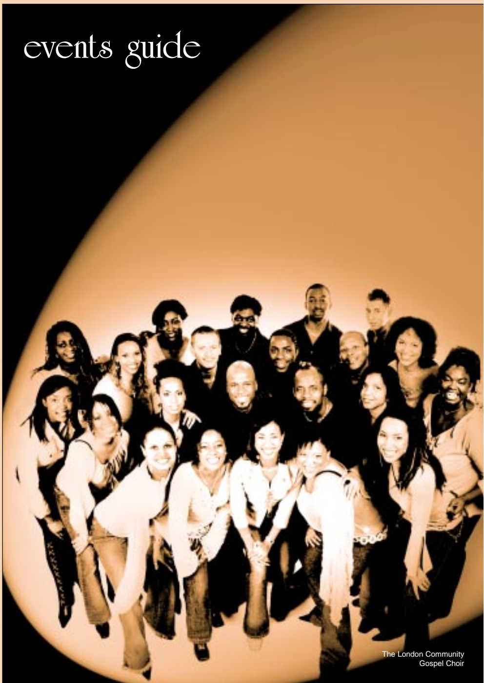
The London Community Gospel Choir

Designed & Produced by Digital Imaging 01453 511237