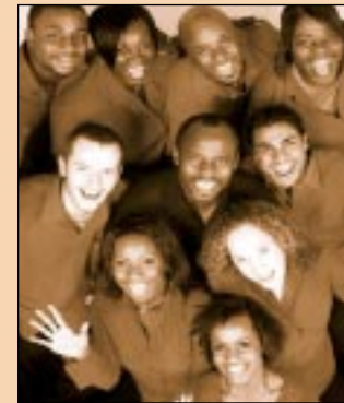
Supported by: St. Mary Centre

Trying to fit the choir into a neat slot is virtually impossible. The singers are adaptable, flexible and perform dynamic sounds creating rich harmonies and are known for their up-tempo gospel flair, swing beat, R'n'B, traditional and soulful arrangements and invigorating choreography and vocal gymnastics. An outstanding experience!